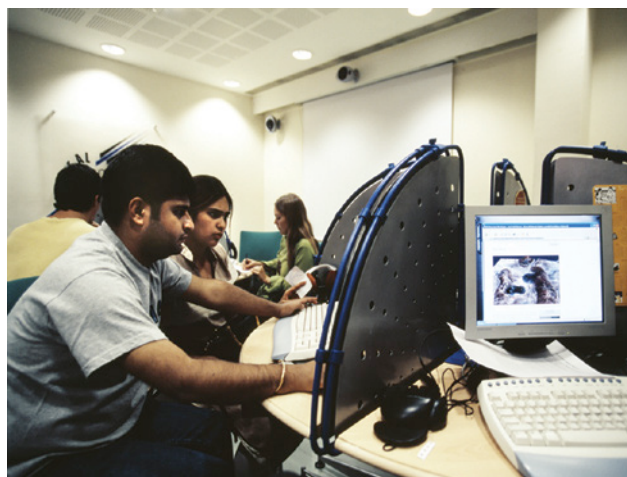
The internet, used by millions around the world. Originally invented by a physicist, Tim Berners-Lee, the internet is used by physicists to link thousands of computers in different countries to form supercomputers capable of handling vast amounts of data.

The more you study physics, the more you will come to realise how the ideas join up. Also, physics is still expanding. Many physicists work in economics and finance, using ideas from physics to predict how markets will change. Others use their understanding of