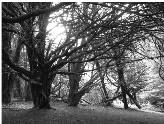
Figure 1.1 Ancient yews at Kingley Vale.