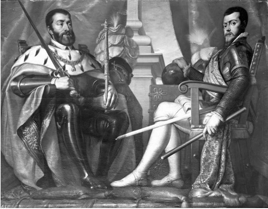
FIGURE 1. Carlos I (1500–58) and Felipe II (1527–99), oil on canvas, Spanish School, sixteenth century. Charles V and a young Philip, probably painted around the time when Philip was traveling in Flanders (1549–50) and participated in the reenactment of scenes from the Amadis of Gaul in Binche.

such as Philip II's age, the political context, the weather, the region visited, the state of the realm, and other sundry variables. The intersection of these different vectors generated unique types of responses and influenced the king's role in each instance. Although festivals, because of their reiterative quality, had important impacts on performers and audiences, each individual festival was also sui generis .