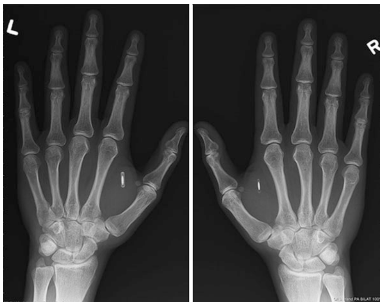
Fig. 2.2 An individual with two RFID implants: His left hand contains a 3 by 13 mm EM4102 glass RFID tag that was implanted by a cosmetic surgeon, his right hand contains a 2 by 12 mm Philips HITAG 2048S tag with crypto-security features, implanted by a GP using an animal injector kit (Graafstra 2007, p 18.)

these devices could essentially replace ‘medic alert’ bracelets and be used to relay medical details when linked with an online medical database. Such devices have subsequently been used to allow access to secure areas in building complexes, for example the Mexican Attorney General’s office implanted 18 of its staff members in 2004 to control access to a secure data room, and nightclubs in Barcelona, Spain and The Netherlands use a similar implantable chip to allow entry to their VIP customers, and enable automated payments. By 2007, reports of people implanting themselves with commercially available RFID tags for a variety of applications became a familiar occurrence (see, for example, Fig. 2.2). The broad discussion on security and privacy issues regarding mass RFID deployment has since picked up pace, and security experts are now specifically warning of the inherent risks associated with using RFID for the authentication of people. 21