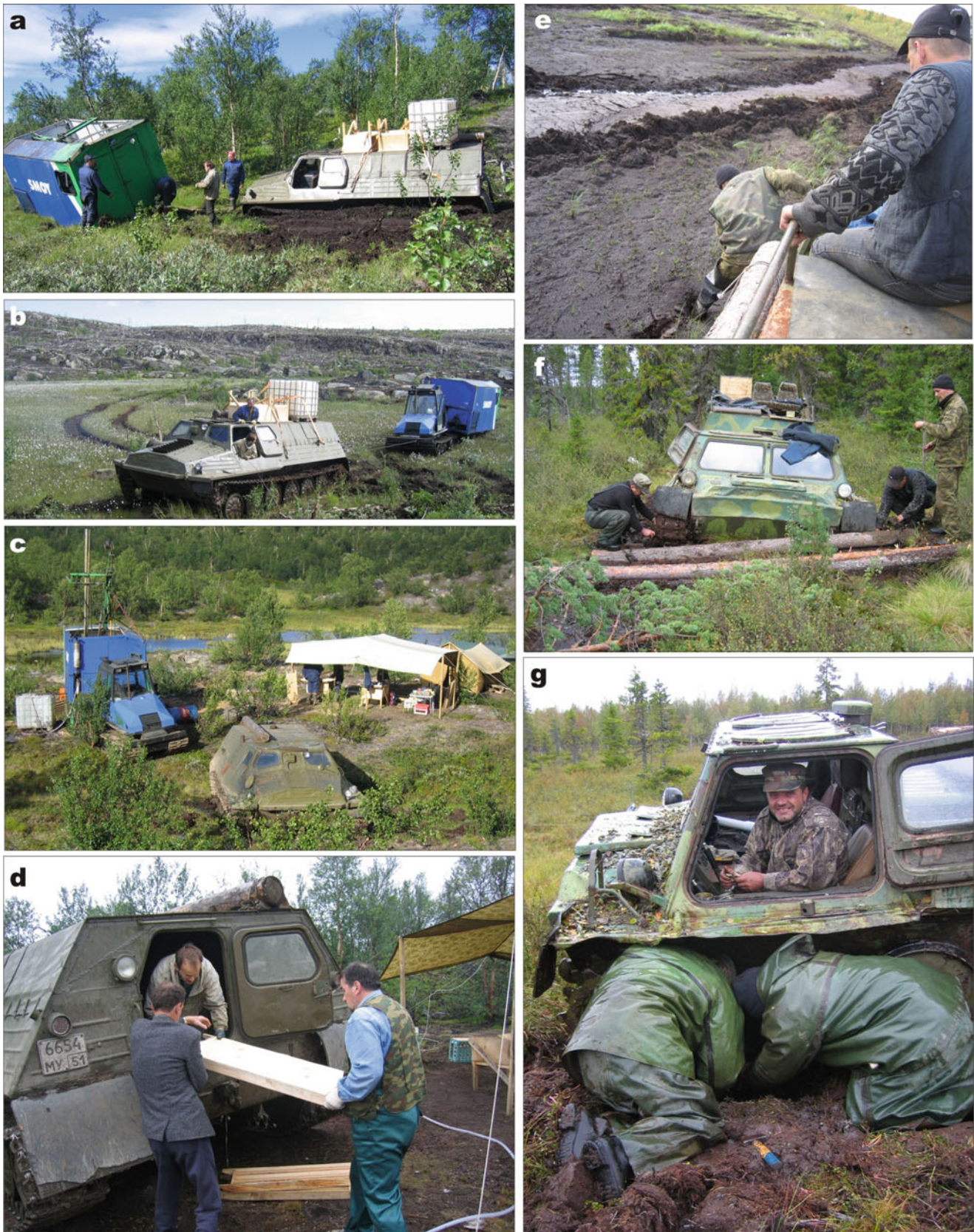
Fig. 2.4 Scientific drilling implemented in the eastern part of the Fennoscandian Shield. The Pechenga Greenstone Belt: (a) Peat bog near site 7A. (b) Military-terrain vehicle assists the mobile drilling rig to negotiate a swamp on its way to site 6A. (c) A field camp at site 8A

and 8B. (d) Loading core in to terrain vehicle at the site 8B. The Imandra/Varzuga Greenstone Belt: (e) ... even don't have a dream to step on it. ... (f) On the way to the site of Huronian-age glacial deposits. (g) Breakdown on the way to sites 3A and 4A