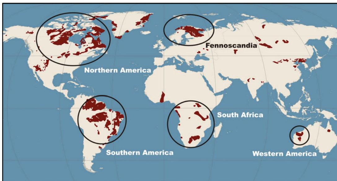
Fig. 2.2 Distribution of Palaeoproterozoic rocks (red) with circled areas highlighting the most continuous and thickly developed volcano-sedimentary successions sections (Map compiled by Aivo Lepland)