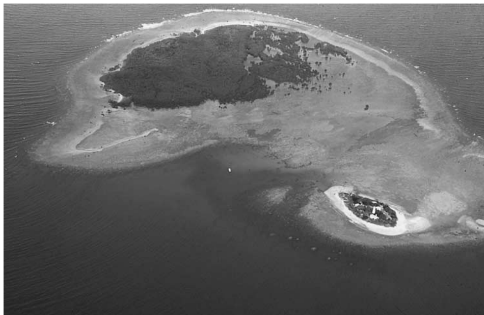
Figure 1.2 Low Isles, a low wooded island near Cairns and site of the 1928–29 Royal Society Expedition.