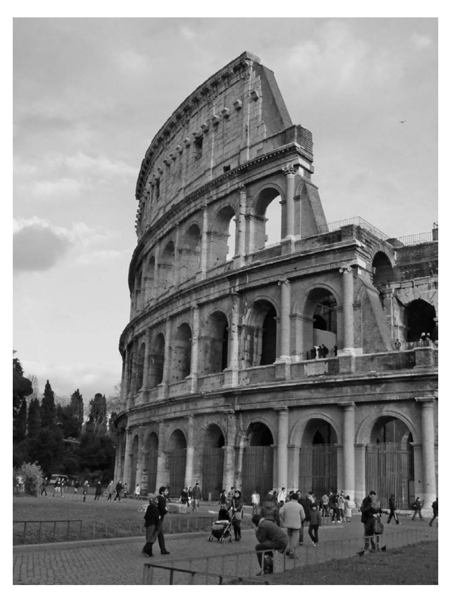
Figure 1.2 The Colosseum, Rome.

the amphitheatre rises in full view, were Nero's lakes . . . Rome is returned to herself.' The Colosseum too was able to function as a metonym.