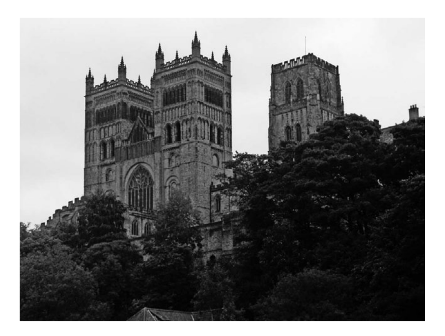
Figure 1.1 The Cathedral, Durham City.

their marching momentous. Seven hills lend gravitas to Pierre's account, turning struggle into an image of triumph.