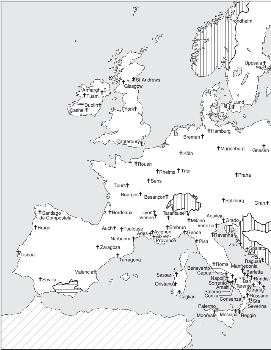
Map 1.1 Latin Christendom in 1400 and the European Union (2004).