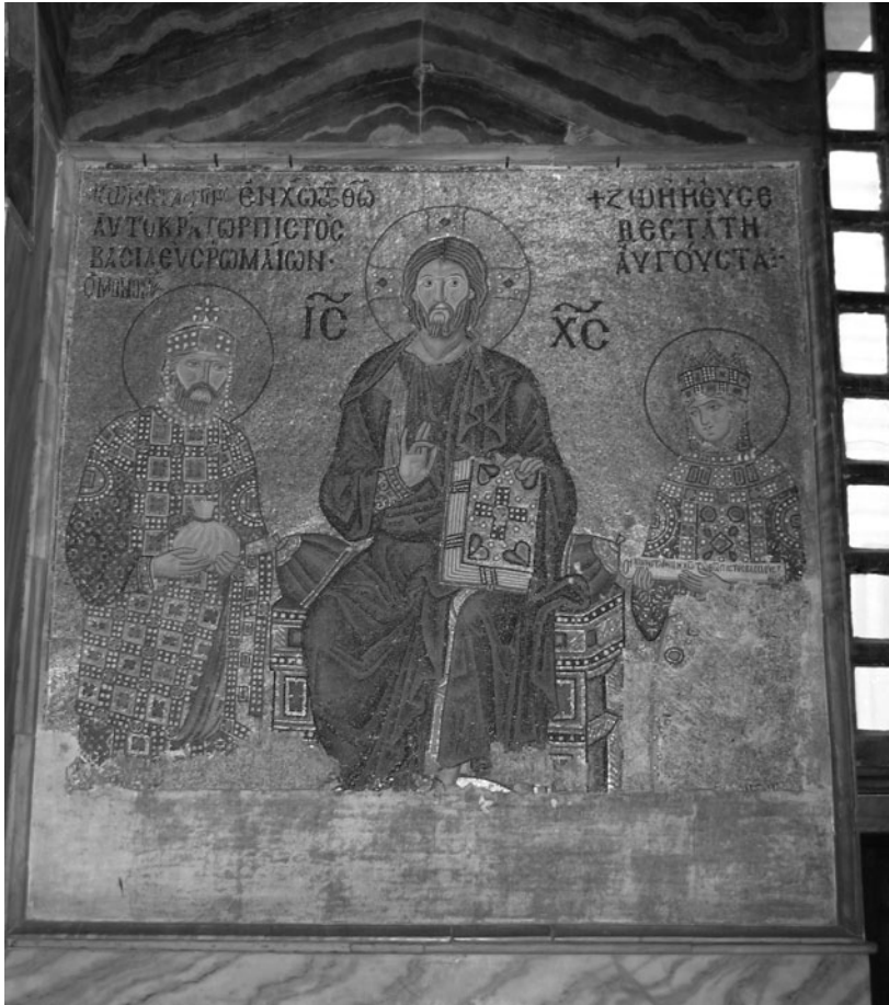
Figure 0.2 Constantine IX Monomachos and Zoe with Christ, south gallery mosaics, Hagia Sophia, Constantinople, eleventh century