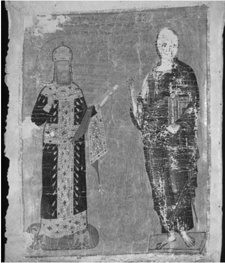
Figure 0.4a Chrysobull of Andronikos II Palaiologos, 1301, Byzantine and Christian Museum, Athens (BXM 00534)

nearly 80 inches in length, the chrysobull concludes with the emperor's signature in deep red ink and commences with a miniature of Andronikos offering to Christ a rolled white scroll meant to reference the chrysobull itself. The miniature thus depicts the emperor in the act of donating the very scroll that bears both the representation as well as the textual attestation of the gift itself. The imperial portrait on Palaiologan chrysobulls such as this solidifies the emperor's gift in an almost legal manner, while simultaneously transforming the viewer into a witness to the transaction. 16