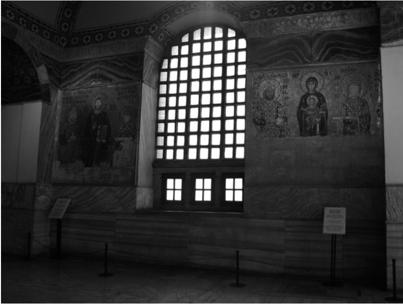
Figure 0.1 Hagia Sophia, Constantinople, general view of the mosaics on the east wall of the south gallery

specific acts of donation to the church (Figure 0.1). These panels present a double articulation of imperial gift-giving separated by roughly a century: Constantine IX Monomachos (r. 1042–55) and Zoe with Christ occupy the north side of the wall to the viewer’s left (Figure 0.2), and John II Komnenos (r. 1118–43) and Eirene with the Virgin and Child appear on the south side to the right (Figure 0.3). 11 The Macedonian and Komnenian emperors hold sacks of money, their monetary offering for the church, and the empresses carry scrolls with inscriptions, signaling a recording of the donation. 12 The