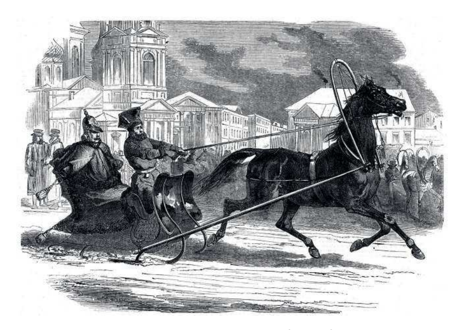
Figure 1.1: This 1853 illustration shows Nicholas I, father of Alexander II, being driven through St Petersburg; at this time, the Tsar was all-powerful.

This book is designed to prepare students for Imperial Russia, Revolution and the Establishment of the Soviet Union (1855–1924). This is Topic 12 in HL Option 4, History of Europe for Paper 3 of the IB History Diploma examination. This option examines the conflicting parts played by modernisation and conservatism in Tsarist Russia and explores reasons for the eventual collapse of the Tsarist autocracy in 1917. It explores continuity and change through the revolutions of 1917, the Civil War and the rule of Lenin. There is a particular focus throughout on the interaction of the social, economic and political factors responsible for change.