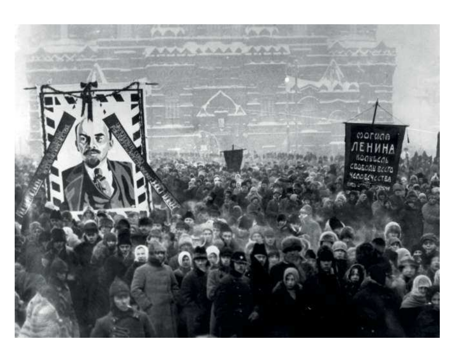
Figure 1.2: The 1924 funeral procession of Vladimir Lenin, attended by four million people. By 1924, Russia had undergone huge changes and was a communist state