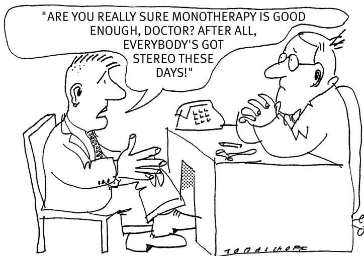
Fig. 9: “Monotherapy”