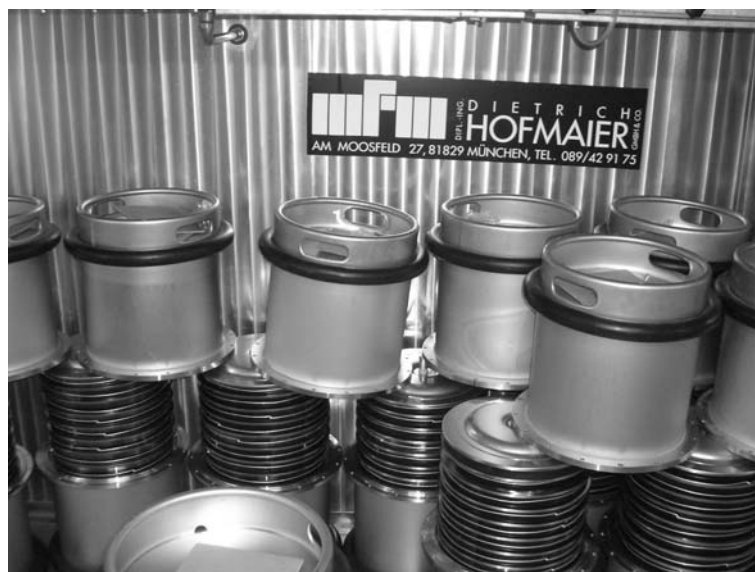
Fig. 3.3. Climate chamber for microfilms

data-oriented (alphanumeric) documents such as parts lists. Nowadays, the enhanced quality of recorders (and scanners, if no digital sources are available), combined with the increased processing capabilities of computers, allows raster images of high resolution to record at an impressive speed. Many archives and libraries, including, e.g., the Cornell University Library (CUL), 4 use this method for archiving purposes. The digital processing also allows different quality on-line versions to be generated. These may serve, e.g., as low-resolution working copies or finding aids (thumbnails).