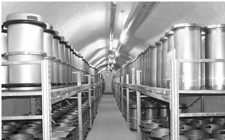
Fig. 3.2. Storage of kegs