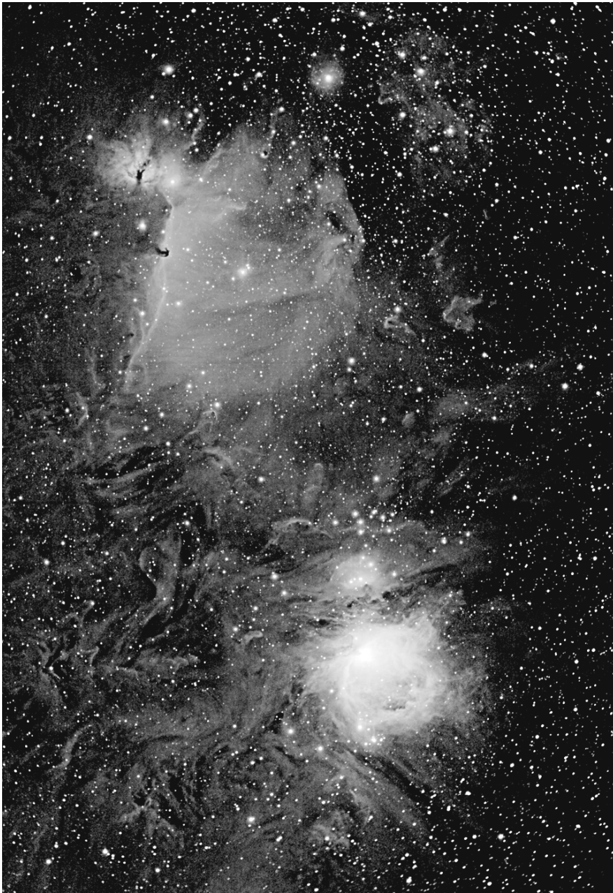
Fig. 1.1. Turbulent ionized plasmas filling a nearby region of space around the active star-forming region of the Orion Nebula.