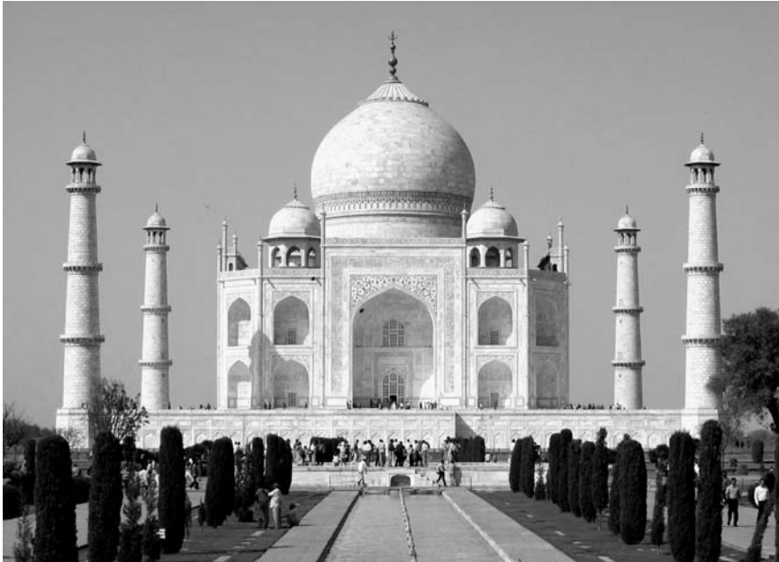
Figure 2-3. Taj Mahal 79

In Rajasthan, the Rajputs remained strong Hindu powers but eventually became vassal states of the Mughal empire. In central India, the Marathas gathered Hindu support under their leader Shivaji. Between 1646 and 1680, he did many heroic acts against the Mughals, was even taken prisoner by the Mughals but managed to escape from Agra Fort again. In the long run, they managed to undermine the Mughal empire by supplying troops and then actually taking control of the land. The expansion of the Marathas to the west was halted by Ahmad Shah Durani from Afghanistan in 1761, but at least they managed to consolidate their power in central India. Nonetheless, they did not manage to hold up against the British imperial power.