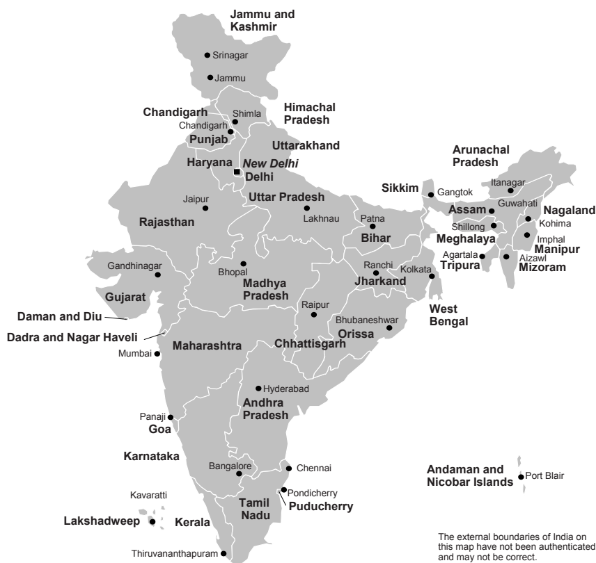
Figure 2-1. The Indian subcontinent

India is rich in minerals; with an estimated 200 billion tons, coal is India's most important natural resource. While there are also some supplies in iron ore, manganese, chrome, magnesium, bauxite, copper, lead, and zinc, India is a net importer for most resources. Crude oil is very rare which poses a big challenge for India's future economic development.