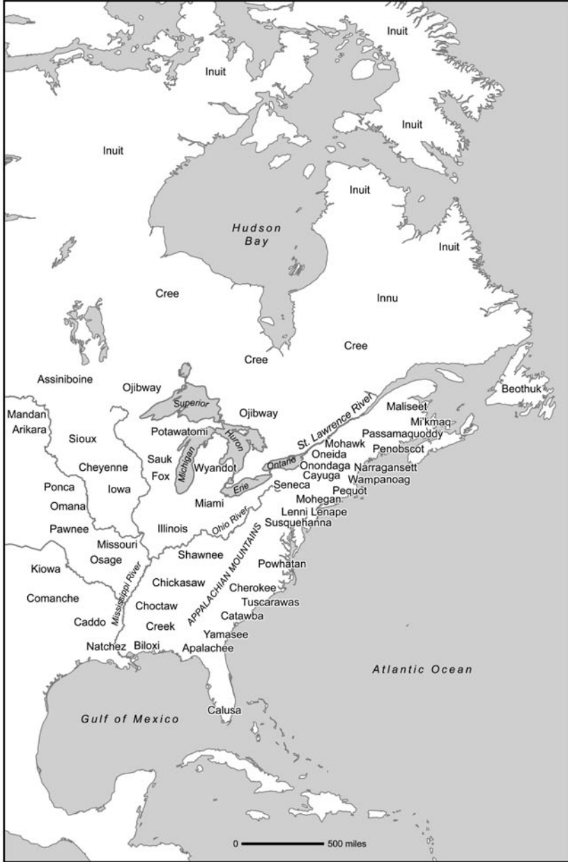
Map 4 Eastern Native North America, c.1700