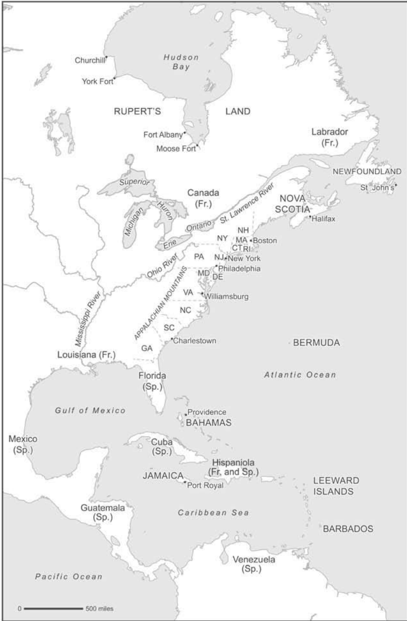
Map 5 British America, c.1750