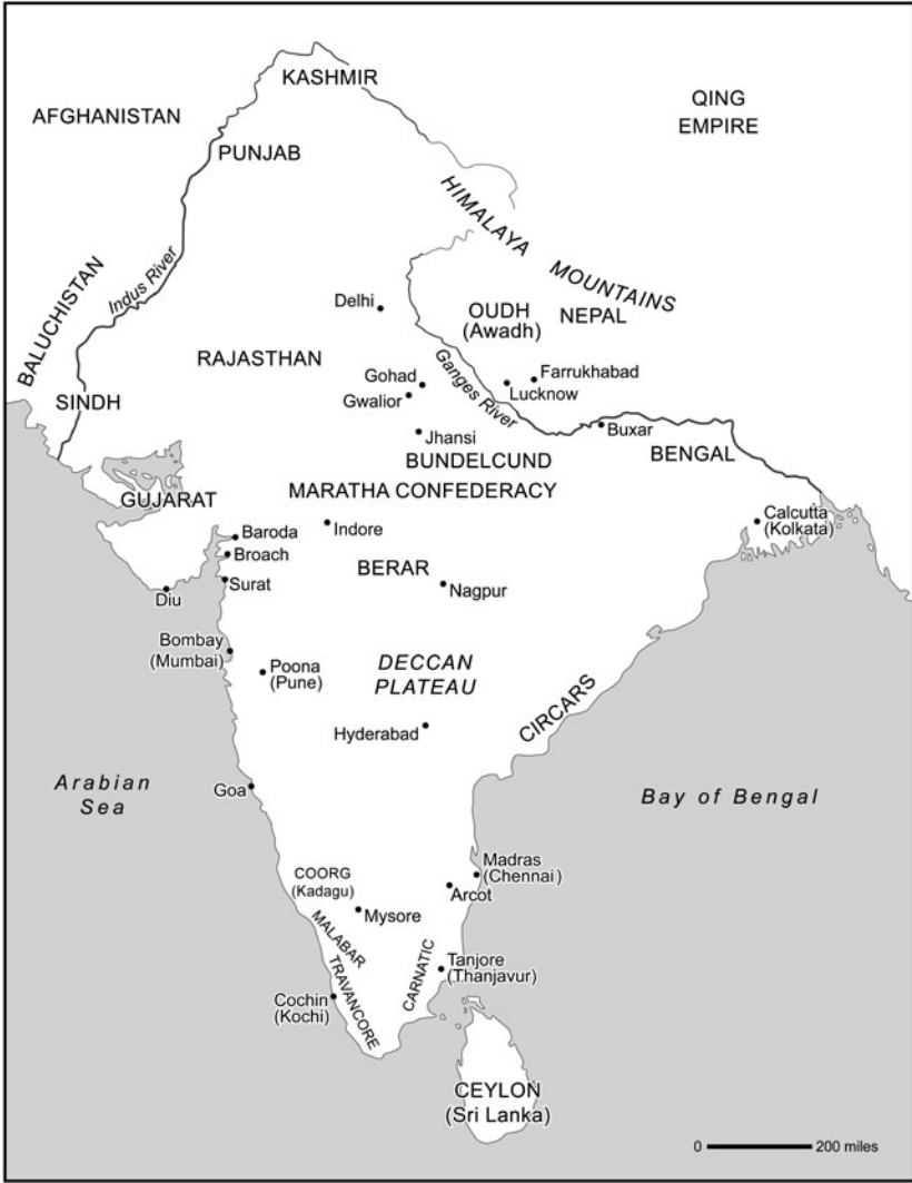
Map 3 South Asia, c.1750