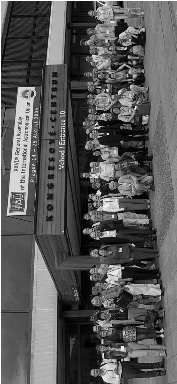
Attendees photographed during the meeting in Prague.